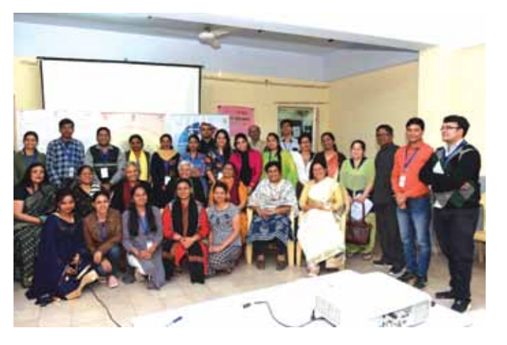
Three Days Residential workshop for Social Workers of Delhi from 14th to 16 March, 2019 at National Bal Bhavan, New Delhi.