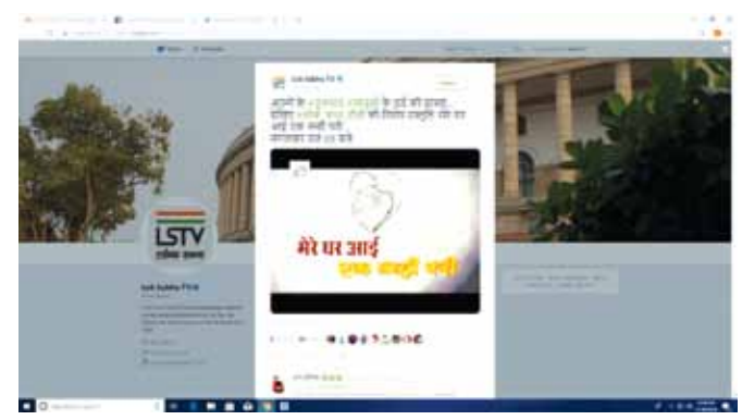
A programme 'Mere Ghar Aayi Ek Nanhi Pari' was streamlined on Lok Sabha TV regarding Adoptions on 27th August, 2018