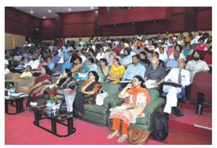
17th September 2018 at Chandigarh, Punjab