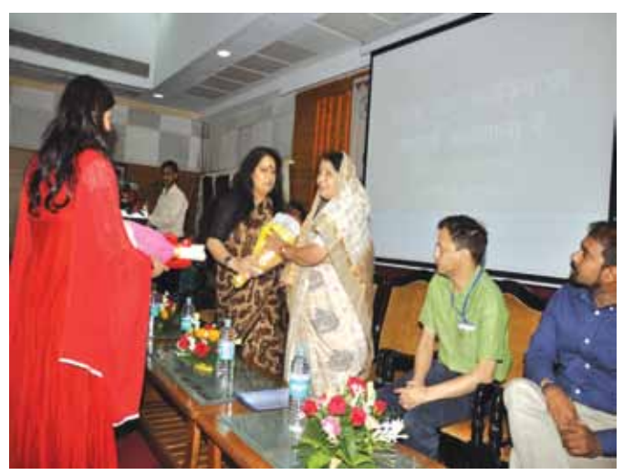
25th and 26th June 2018 at Raipur, Chhattisgarh