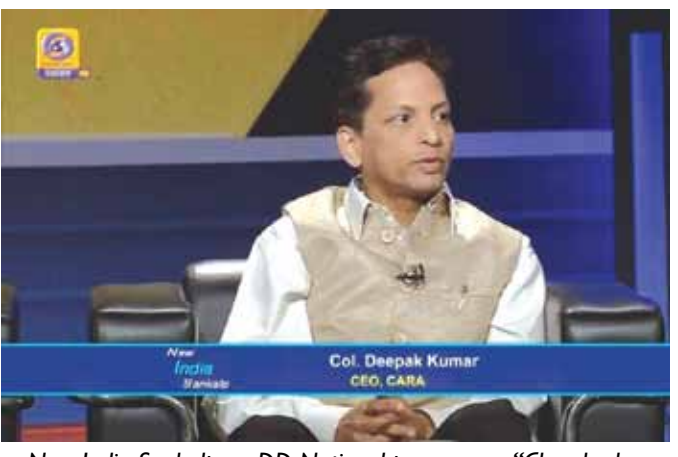
New India Sankalp on DD National programme "Charcha ka Vishay" on 15th November, 2018