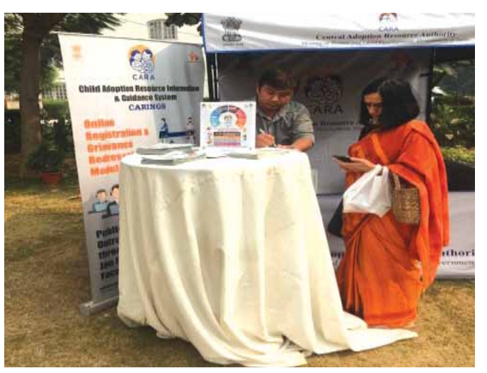
CARA at the National Organic Festival, 2018 organised by MWCD from 26<sup>th</sup> October to 4<sup>th</sup> November, 2018 at Indira Gandhi National Centre for the Arts.