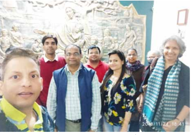
Inspection of Holy Cross Society, New Delhi 24th November, 2018