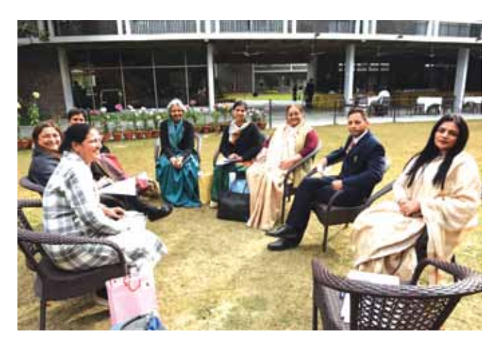
First Meeting of the Sub-Committee held at India International Centre, New Delhi on 15<sup>th</sup> January, 2019.