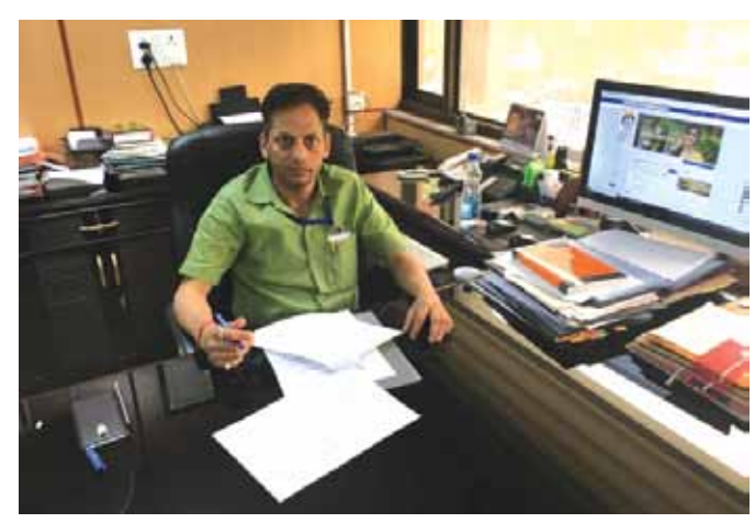
Live Q & Ans with CEO, CARA held through Social Media on 15th May, 2018.