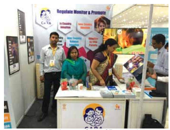
National Exhibition on State of Emerging India, organized by Skoch Consultancy and Services Pvt. Ltd. on 22<sup>nd</sup> June, 2018.