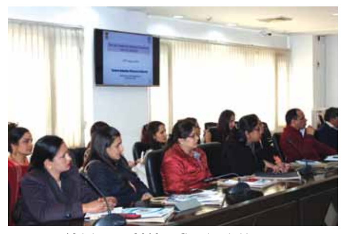
18th January 2019 at Chandigarh, Haryana