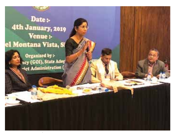
4<sup>th</sup> January 2019 at Siliguri, West Bengal