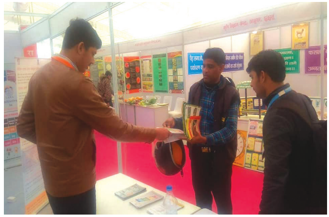
CARA participated at the National Expo & Seminar organization by Cyme Social Development on the moto of "SABKA SATH, SABKA VIKAS" held at Jhunjunu, Rajasthan named 'SRAJAN' from 25th to 27th January, 2019.

2.4.2 Hausla 2018: Ministry of Women and Child Development, Government of India organized HAUSLA 2018, as part of the Children's Day Celebration Week from 26<sup>th</sup> to 29<sup>th</sup> Nov 2018. The second addition to this yearly program was inaugurated by the Secretary MWCD along with other officials from MWCD and it's associated bodies at NIPCCD (National Public Cooperation and child Development). The program marks a celebration and opportunity created for children residing in the Child Care Institutions across the country, a unique