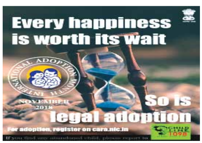
Advertisement published in 41 newspapers across the country emphasizing on Legal Adoption on 18th November, 2018 (International Adoption Month).