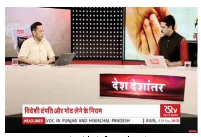
Desh Deshantar - गोद लेने के नियम और सरोकार :Adoption rules and concerns on Rajya Sabha TV on 24th September, 2018