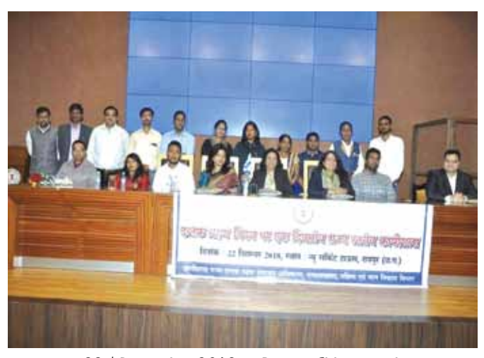
22<sup>nd</sup> December 2018 at Raipur, Chhattisgarh