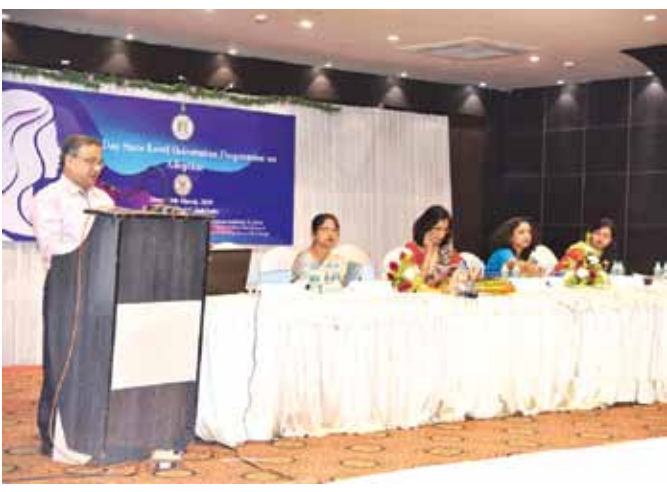
14th March 2019 at Kolkata, West Bengal