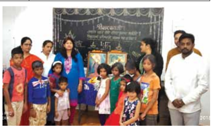
Inspection of SAAs at Bidar, Karnataka by Advisory Committee Member