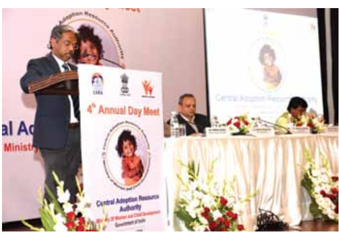
The Annual Calendar 2019 of CARA along with Souvenirs of CARA were released by the Chairperson, Steering Committee along with other officials of MWCD. The meet was marked by a musical presentation of a Vandana and medley by the children from Udayan Ghar, New Delhi.