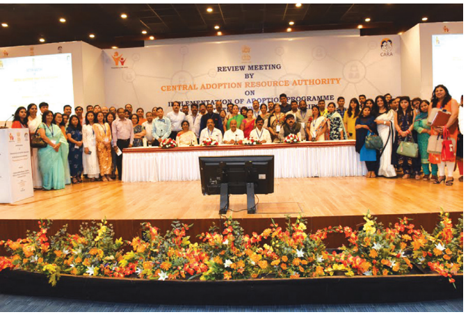
Hon'ble Union Minister Smt. Maneka Gandhi chaired a Review Meeting convened by Central Adoption Resource Authority on 'Implementation of Adoption Programme by the States & UTs' at New Delhi on 30th July, 2018.