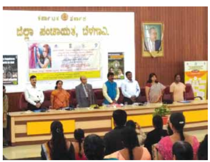
4th January 2019 at Belagavi District, Karnataka